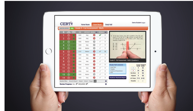
Take the assessment online/offline, instantly grade, and watch videos from an expert tutor